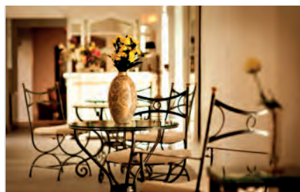
Antiq Palace Hotel and Spa, Ljubljana