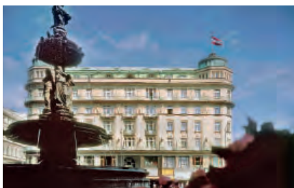
Hotel Bristol, Vienna