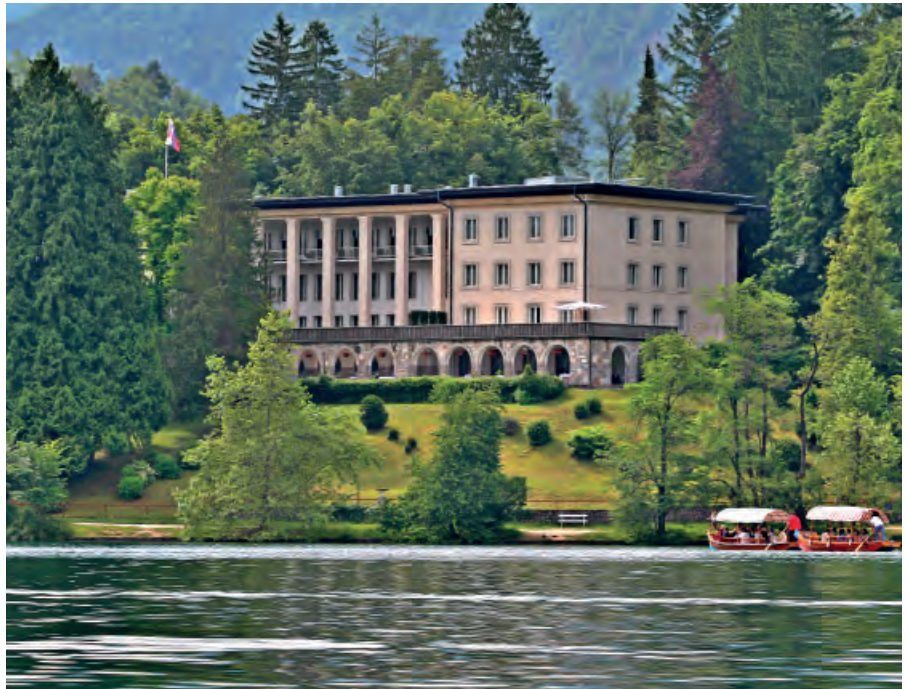
Vila Bled, Lake Bled

Ca'Sagredo Hotel is situated on the banks of the Grand Canal, close to the Rialto market. This elegant hotel enjoys a restaurant with panoramic terrace, cosy bar and just 42 rooms and suites.