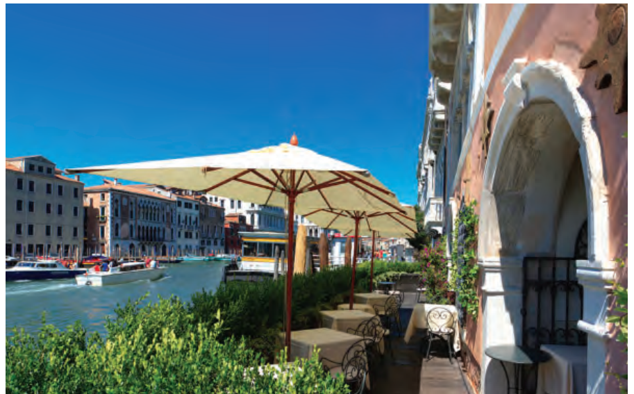
Cas' Sagredo, Venice

Hotel Bisanzio is well-located around 300 metres from St Mark's Square. This 16th century palazzo offers comfortable rooms with parquet flooring and Murano glass lamps.